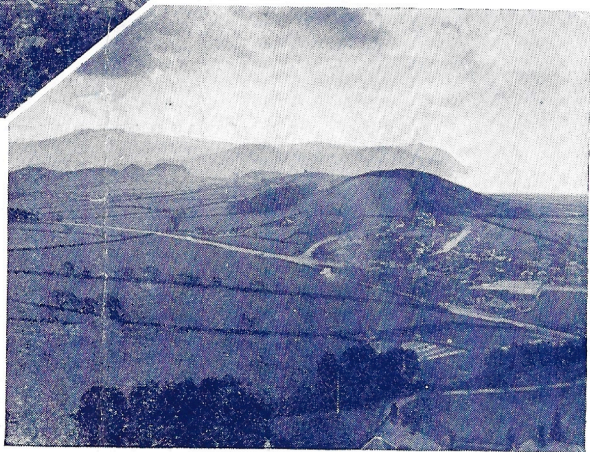
Views from the Old Watch Tower