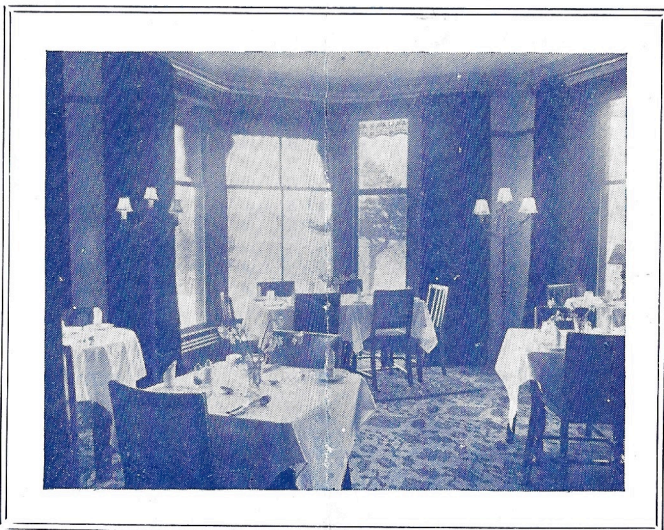
A view of the Dining Room